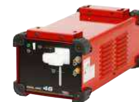
COOLARC® 46 K14105-1